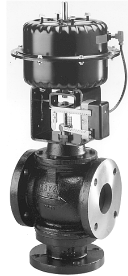
V-9502 Positioner Installed on a Rubber Diaphragm Type Valve Actuator

The starting point is the input pressure (Pilot P pressure) at which the actuator just begins to stroke. The starting point is field adjustable from 2 to 12 psig (14 to 83 kPa) using the starting point adjusting screw located under the V-9502 Positioner cover. Turning the screw clockwise decreases the starting point, and turning the screw counterclockwise increases the starting point.